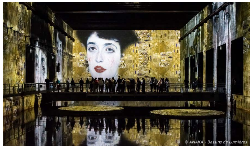
© ANAKA - Bassins de Lumières

Would you like to know more about this solution? Then visit www.barco.com/en/product/entertainment-essentialcare