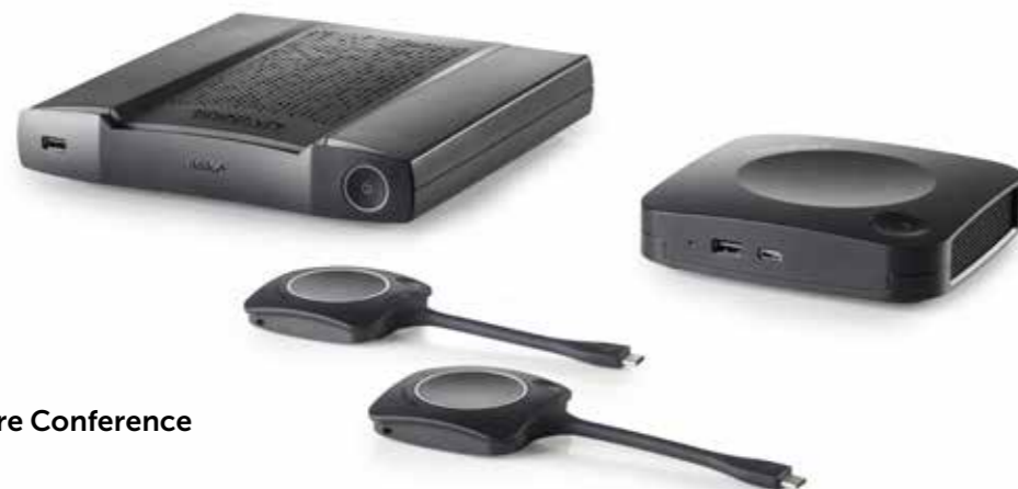
Barco ClickShare Conference

Discover the combinations of superior wireless conference solutions from Barco and Shure networked audio solutions for all your meeting rooms. All tested and fully compatible.